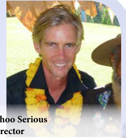
Yahoo Serious Director